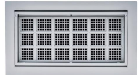
GRAY FFWF12TF-G FFWF08TF-G FFWF05TF-G