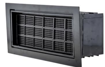
5" Depth - Wood Frame