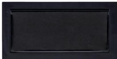
FFNF05TF with Exterior Winterizer Insulator Accessory