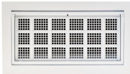
WHITE FFWF12TF-W FFWF08TF-W FFWF05TF-W