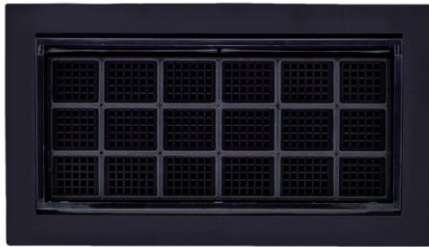
BLACK FFWF12TF FFWF08TF FFWF05TF