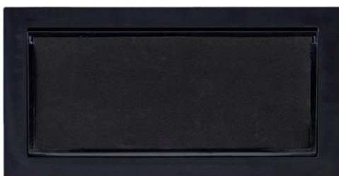
FFNF05TF with Exterior Winterizer Insulator Accessory