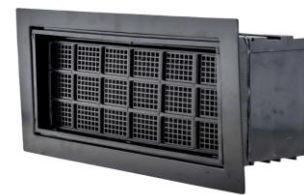
5" Depth - wood framed walls