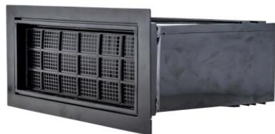
12" Depth - block with brick/stone front