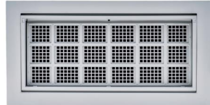
GRAY FFWF12TF-G FFWF08TF-G FFWF05TF-G