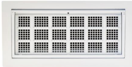
WHITE FFWF12TF-W FFWF08TF-W FFWF05TF-W