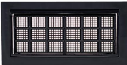
BLACK FFNF12TF FFNF08TF FFNF05TF