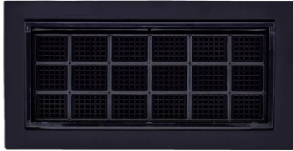
BLACK FFWF12TF FFWF08TF FFWF05TF