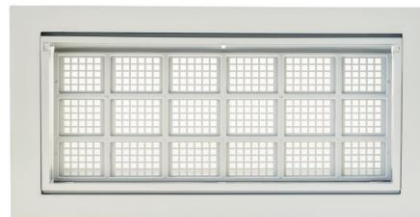
WHITE FFNF12TF-W FFNF08TF-W FFNF05TF-W