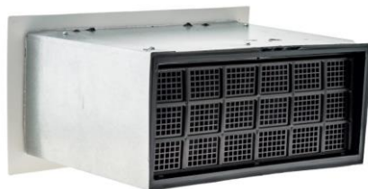
Fire Damper Kit FFFDKT 16" L x 8" H x 12" D