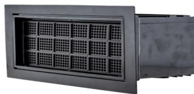
8" Depth - block with stucco