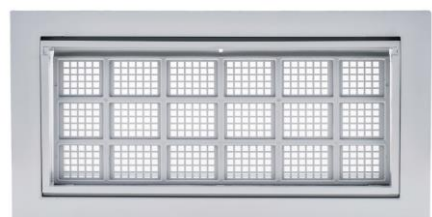
GRAY FFNF12TF-G FFNF08TF-G FFNF05TF-G