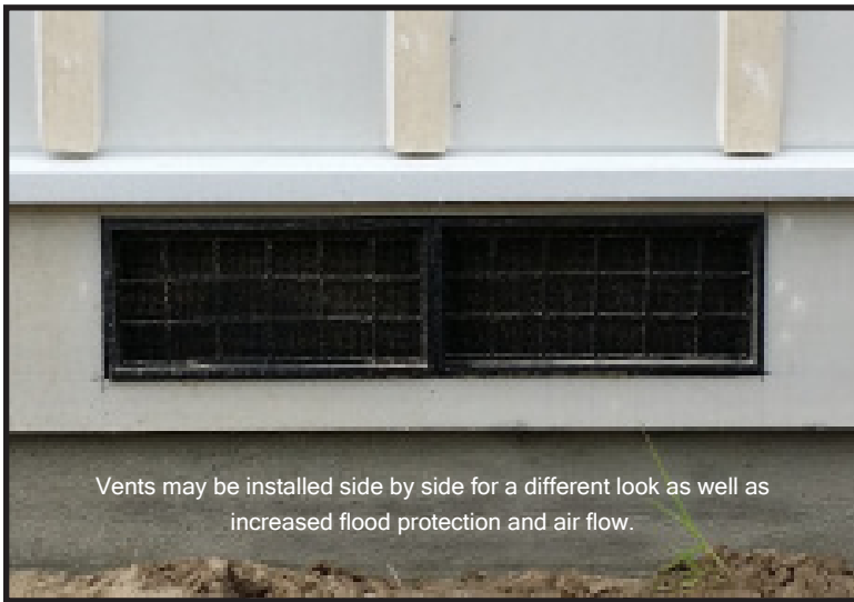
Vents may be installed side by side for a different look as well as increased flood protection and air flow.