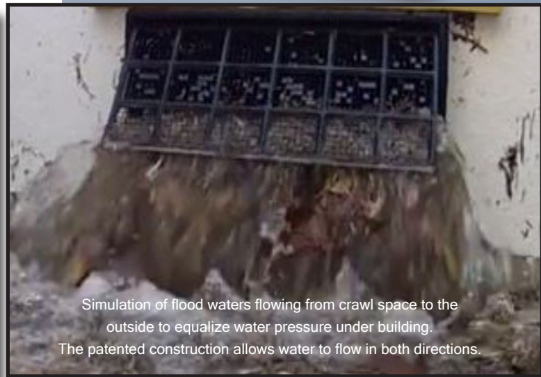
Simulation of flood waters flowing from crawl space to the outside to equalize water pressure under building. The patented construction allows water to flow in both directions.